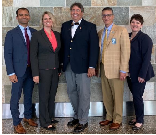
Pictured left: Central District Delegation at American Dental Association meeting in San Francisco, CA